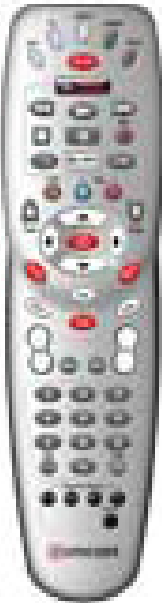
Silver with Red Ok/Select Button