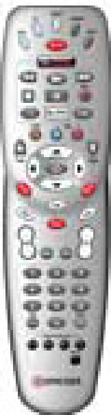
Silver with Grey Ok/Select Button