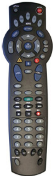
Atlas DVR Day 1055